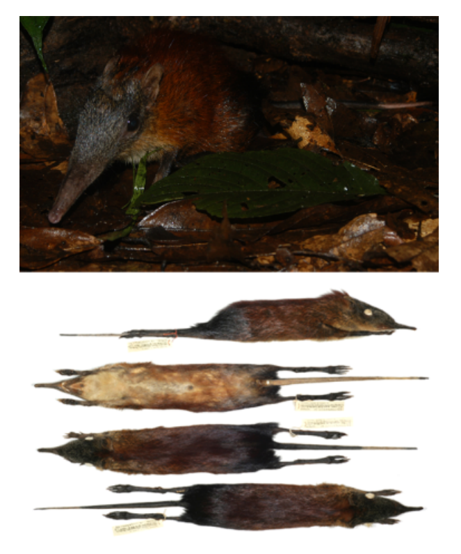
Figure 2 Photographs of Rhynchocyon udzungwensis sp. nov.: above, captive live animal (holotype, CAS 28043, photo F. R.); below, four specimens (three paratypes and holotype) prepared as study skins. From top to bottom: BMNH 2007.7, FMNH 194127, MTSN 6000, CAS 28043 (photo D. Lin, CAS). BMNH, British Museum of Natural History; CAS, California Academy of Science; FMNH, Field Museum of Natural History; MTSN, Museo Tridentino di Scienze Naturali.

denser, fluffier and greyish or brownish fur of the Macroscelidinae. The first 2 cm of the exceptionally long nose are essentially naked and black. The hair on the sides and top of the face back to the base of the ears has black bases and cream to pale white tips, giving a grizzled grey appearance. A maroon nuchal crest 2-2.5 cm high, about 1 cm higher than the ear crowns, starts between the ears and extends back about 3 cm. The maroon colour of the crest encroaches about 1 cm into the grey pelage of the forehead and forms an indistinct stripe that widens along the back from behind the ears to the rump, where it narrows and integrates with the jet-black fur over about 3 cm to a point about 3 cm above the tail insertion. The lower rump is jet black. In certain lights and from certain angles, two parallel slightly darker lines are barely visible within the maroon dorsal stripe, each with up to four very faint pale spots near the leading edge of the black rump. This vestigial chequering is similar to that of R. petersi and R. chrysopygus. The black rump hair is about the same length as the pelage on the surrounding areas. The jet-black fur on the lower rump extends to the upper thighs and down onto the rear legs. The fur behind the ears and on the shoulders is grizzled yellow-rufous and becomes orange-